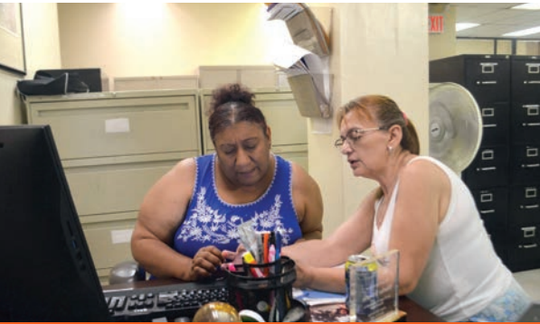
BENEFITS ACCESS & ASSISTANCE

As part of our immigration services, BronxWorks offers English for Speakers of Other Languages (ESOL) classes to non-native adult English speakers at multiple BronxWorks locations. Through the ESOL program, participants acquire sufficient language abilities to enhance the quality of their lives, while also finding a sense of community with their peers. This year, the students came together to celebrate the completion of the program with a talent show! Dozens of students were in attendance to watch and perform various talents, including singing, group dance, and individual dance. The performances allowed the students to show off some of their new knowledge and the event culminated with the students receiving graduation certificates. BronxWorks also supports with preparing and submitting applications for U.S. Citizenship, as well as offering legal services to those seeking assistance with immigration matters.