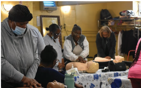
OLDER ADULT CLASSES

Older adults have the opportunity to learn new skills through a variety of activities at our older adult centers. Throughout the year, our centers offered classes in sewing, music, dancing, exercise, as well as lifesaving skills such as CPR and fire safety. Many of these classes were conducted for several weeks and culminated in a showcase event with their peers. Older adults also have access to the BronxWorks English for Speakers of Other Languages (ESOL) program, with some classes offered within the older adult centers. BronxWorks Older Adult Centers offer many other activities and services as well, including daily meals, holiday celebrations, trips to local stores and attractions, case management, and referrals to other BronxWorks services such as benefits assistance and food access.