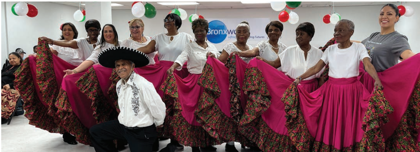
OLDER ADULT CLASSES