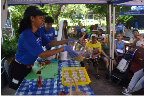
BronxWorks staff conduct a cooking demonstration at the Mott Haven Farm Stand using the same fresh produce that is available to purchase at the stand.