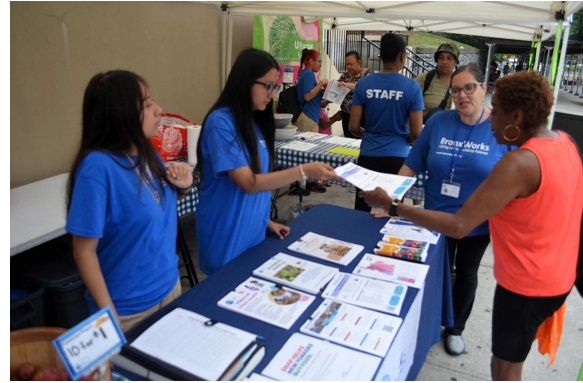
BronxWorks staff at the Community Farm Stand provide attendees with resources on healthy eating and information about other services offered at BronxWorks.