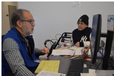
A BronxWorks NYC Free Tax Prep staff member assists a client with filing their tax return.

With April being Financial Literacy Month and the 2025 tax season coming to a close, BronxWorks WFD programming has been in full swing to support our neighbors as they file their taxes and pursue financial security.