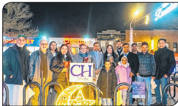
The Castle Hill BID celebrated Ramadan by hosting a lighting ceremony.