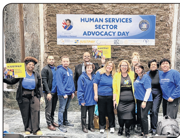
Delegates from BronxWorks took part in Human Services State Advocacy Day at the New York State Capitol in Albany.