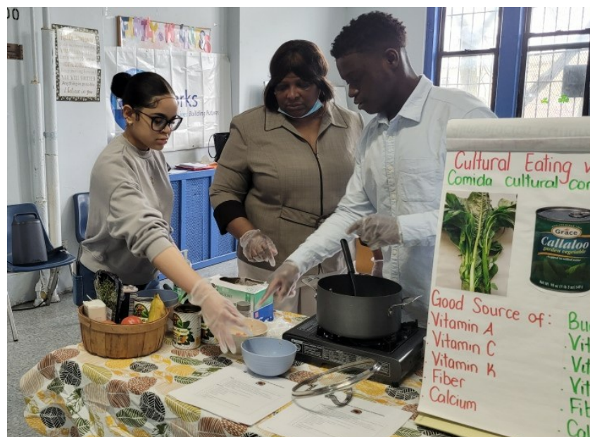
Youth participant leads cooking class on a traditional family meal with other participants.

Recently, participants from BronxWorks E. Roberts Moore Older Adult Center and youth from BronxWorks St. Mary's Park Cornerstone Community Center celebrated the end of the program session with a party and awards ceremony! The children and seniors came together once a week to enjoy different activities and create bonds with their neighbors. Before enjoying pizza and receiving awards, the participants shared a salad that was made with vegetables they grew together in the E. Roberts Moore Center Garden!