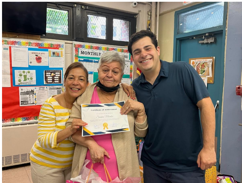
Participants and staff celebrate completion of the program session with an awards ceremony.

BronxWorks youth and adult participants have the opportunity to make connections