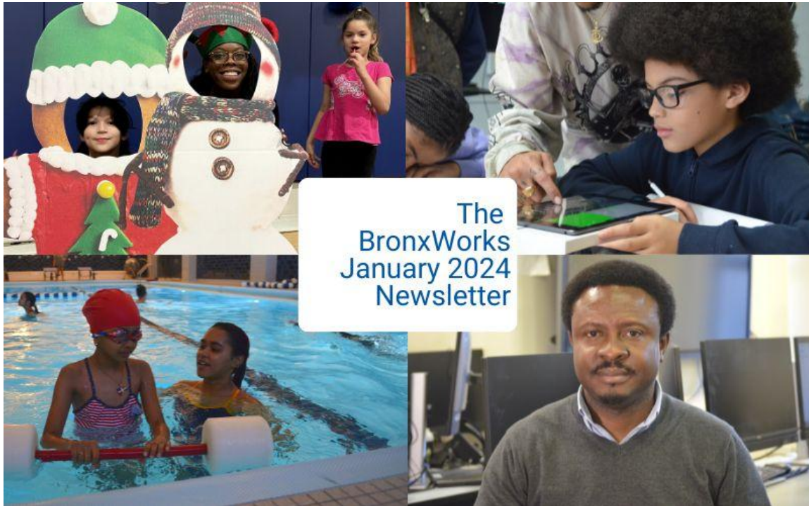
The BronxWorks January 2024 Newsletter