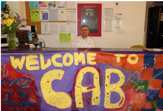
The lobby of the Community Center at 1130 Grand Concourse acquired by CAB in 1995.

The 1990s saw crucial expansion as CAB responded to the growing needs of the borough, opening two family shelters at Nelson Avenue and Jackson Avenue, a borough-wide Homeless Outreach Team and a homeless drop-in center. We also established workforce programs, three senior centers, and importantly, merged with the Girls Club of New York and acquired the community center at 1130 Grand Concourse.