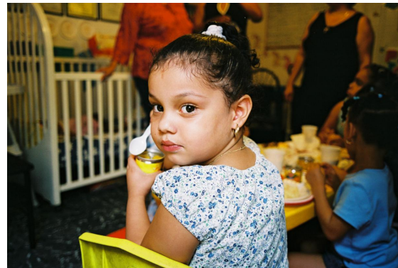
A young BronxWorks participant in the 1990s.

In the 2000s, you can start to see the modern BronxWorks take shape. The organization evolved as the needs of the Bronx grew. We expanded homeless services, including safe havens and shelters. We expanded education and youth development programs, including early learning centers, school-based after-school programs, and college readiness. In 2009, we changed our name to officially become BronxWorks.