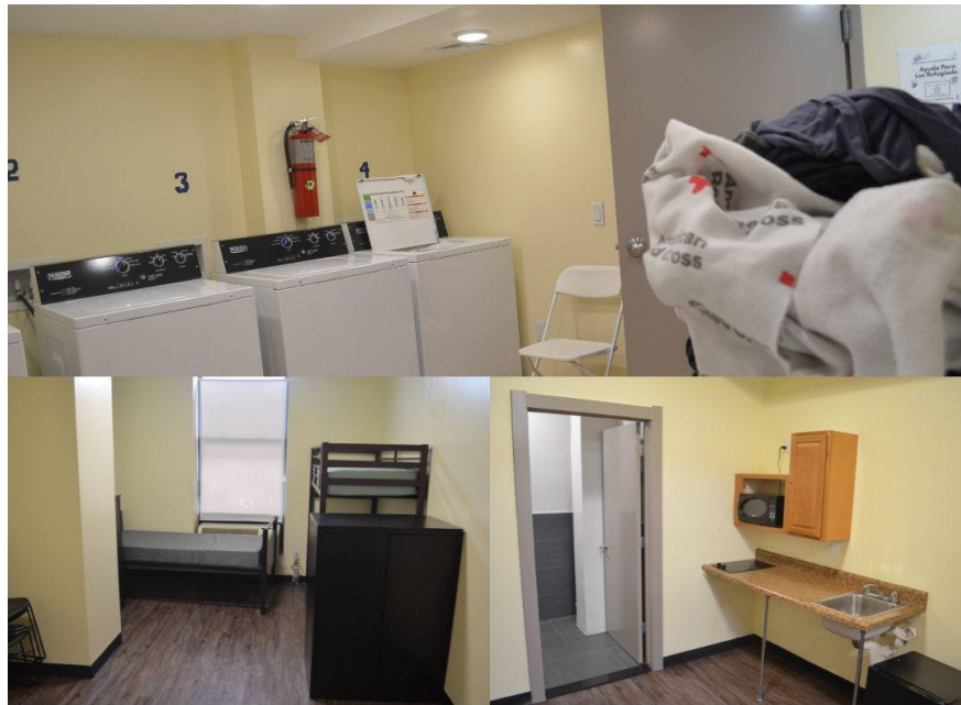
The BronxWorks Family Sanctuary has one bedroom units each with a kitchenette and shared laundry facilities.