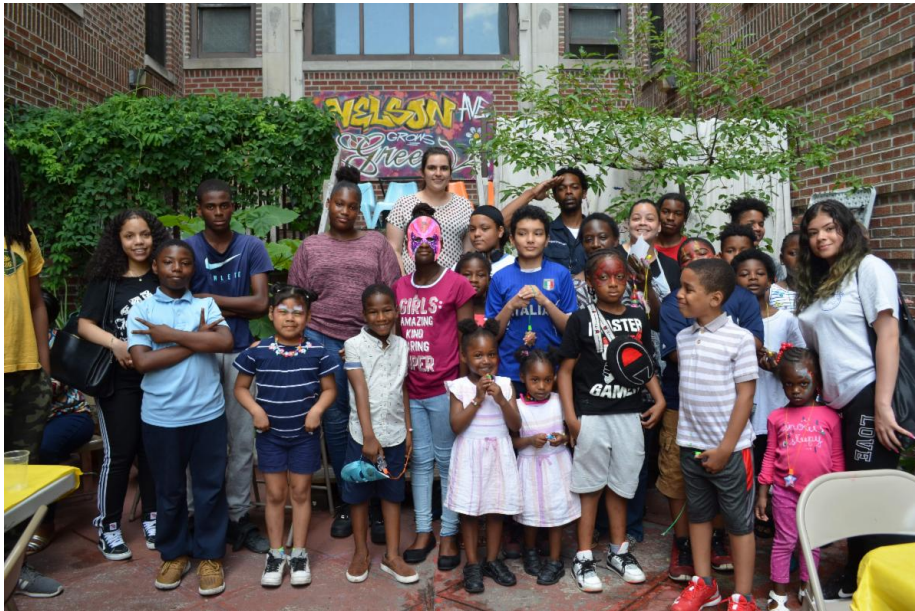
End of the year celebration at the Nelson Avenue Family Residence.

79 families and, with the largest units, can accommodate families of 6-8 people, while JAFR can house 95 families and WAFR can house 102 families at a time. Combined, the three BronxWorks Family Residences can work with and provide shelter for as many as 500 families in a given year.