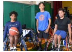
Hoops with the Finest: Bronx cops host wheelchair basketball tournament