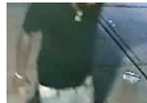
Suspect sought for fatally shooting man during Bronx dispute: NYPD