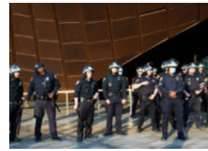
NYPD must hand over 2,700 surveillance docs on 2020 BLM protests: judge

Gillibrand, a Democrat, said she is pushing for free college education in exchange for working in public services like education or health, like New York Gov. Kathy Hochul's initiative to pay CUNY or SUNY tuition for 1,000 health care workers and the upcoming federal Cyber Academy, which will cover college