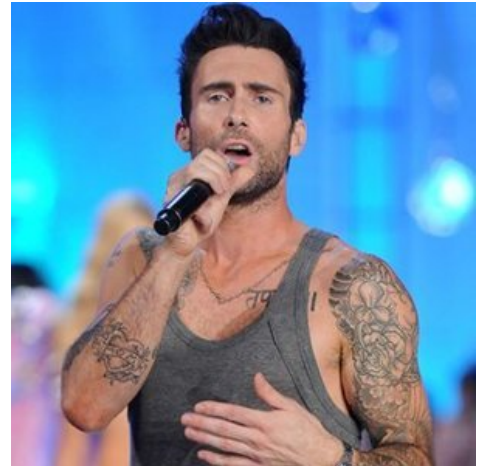
15 Celebs Who Underwent Major Body Transformations