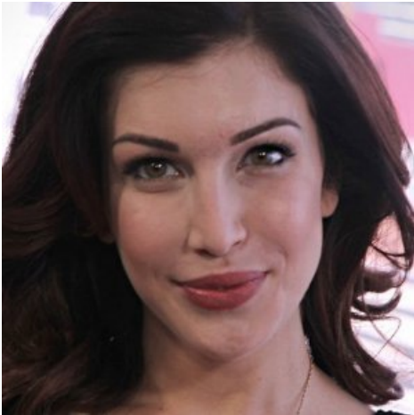
Stars You May Not Know Passed Away