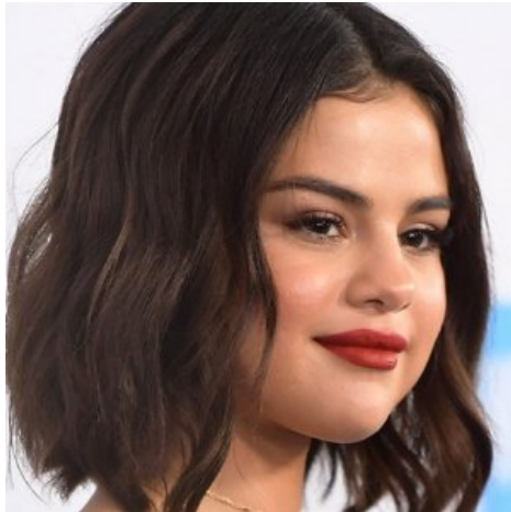
Selena Gomez Debuts New Shaved Hairdo