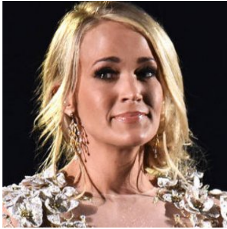
Here's Carrie Underwood's Face 5 Months After Gruesome Injury